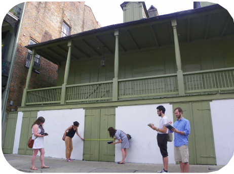
Tulane MPS students in front of Madame John's Legacy in mid-2012.

Madame John's Legacy is one of the oldest buildings in New Orleans and one of only a handful that represent the French/West Indian building style once common in the nascent city. Its architectural significance cannot be overstated, yet for much of its long history the house remained in poor condition.