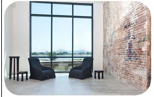
Tenants in the Rice Mill Lofts are prohibited from altering the building's original graffiti.

If you have ever longed to make your home in a century-old industrial rice mill amid preserved graffiti and masonry brick walls, New Orleans' Rice Mill Lofts might be the perfect place for you.